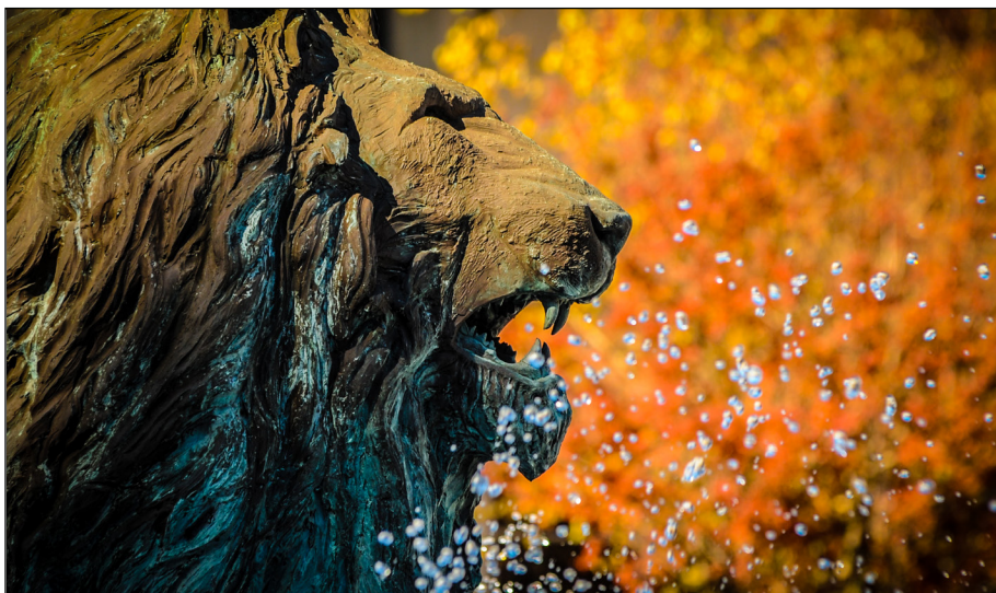
The Lion Statue of Old Dominion University is seen in an undated file photo.